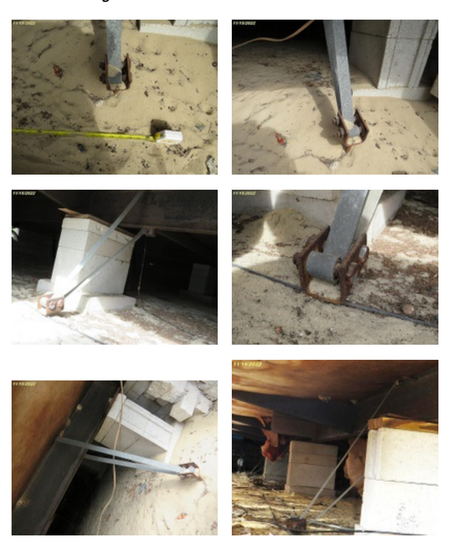
2.6 Number/Spacing of Anchor Method Approximately every 10 feet.