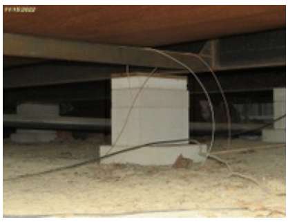
1.18 Interior Support Structure